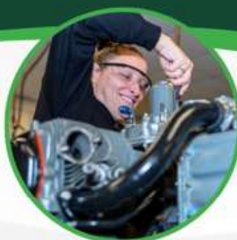
Avionics/ Aviation Maintenance